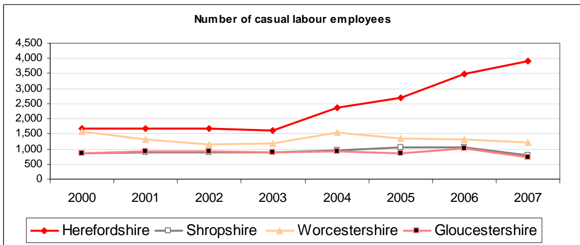
Chart 2: Number of casual labour employees in agriculture, 2000 - 2007

Source: Dept for Environment & Rural Affairs